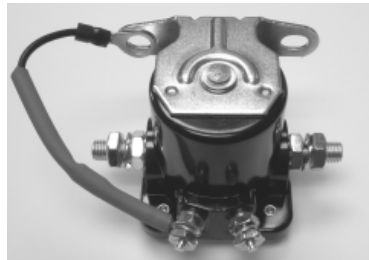
Imprinted on backside of Controller